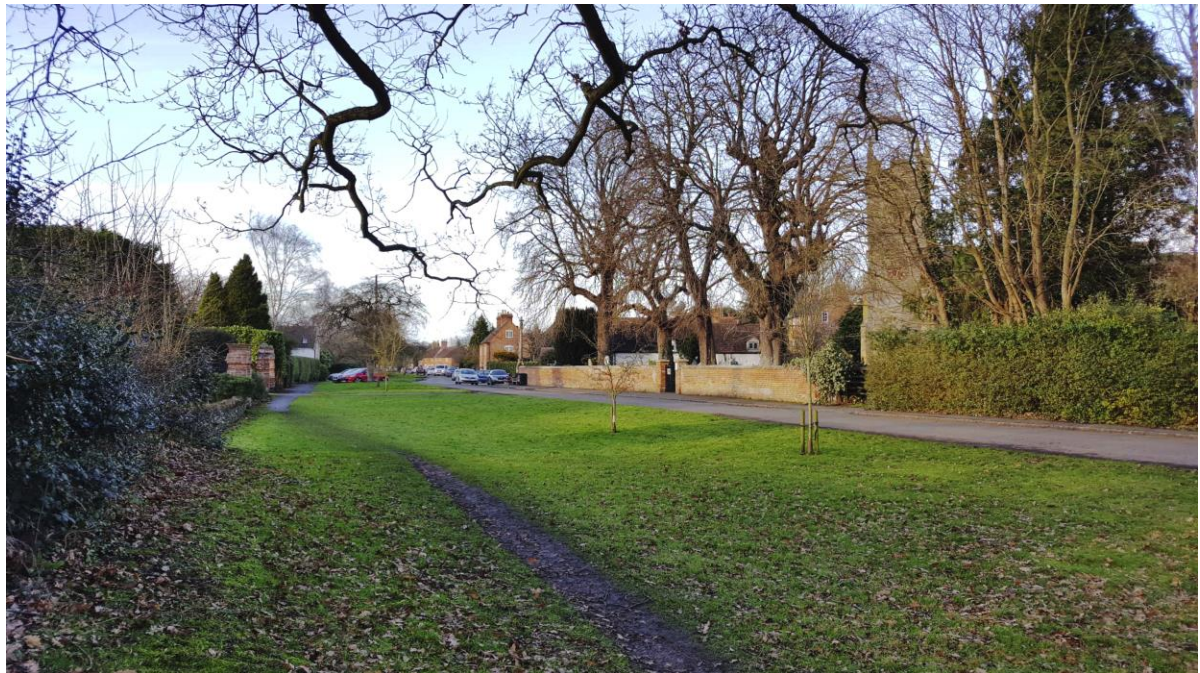
Taken in January 2018